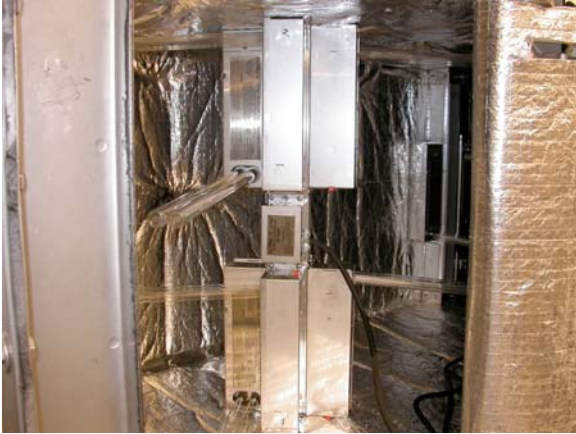
Figure 2-1. Device installed inside the test rig. Front unit shown through door of test rig.