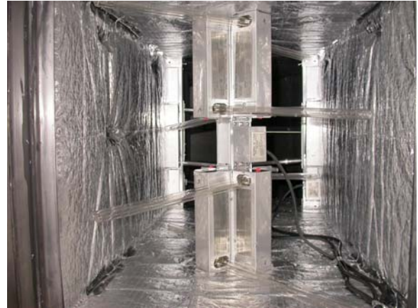
Figure 2-2. Alternate view of device installed inside the test rig. Front unit, 2 back units, and reflective material shown.

For more information on the Altru-V V-Flex, contact: